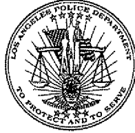
ERIC GARCETTI Mayor