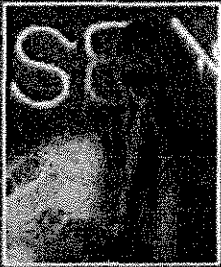
Panel Presentation "Human Sex Trafficking"