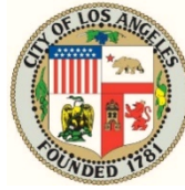
Karen Bass MAYOR

EXECUTIVE OFFICES 221 N. FIGUEROA STREET, SUITE 1245 LOS ANGELES, CA 90012 (213) 978-0738