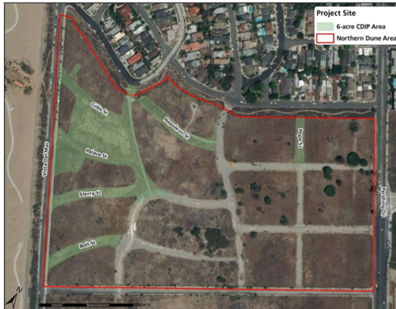
Figure 1. Northern LAX Dunes (48 acres) and CDIP project area.

WHEREAS, the Coastal Dunes Improvement Project (CDIP) is located on the northern part of the Los Angeles International Airport (LAX)/El Segundo Dunes, as illustrated in Figure 1 below. The contract with The Bay Foundation (TBF) began in February 2019 and ends in February 2022. However, work delays and stoppages related to the COVID-19 pandemic prevented the project from progressing in a timely manner; and