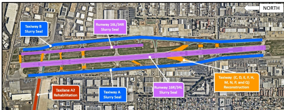
Figure 1 - VNY Airfield Improvement Program Projects