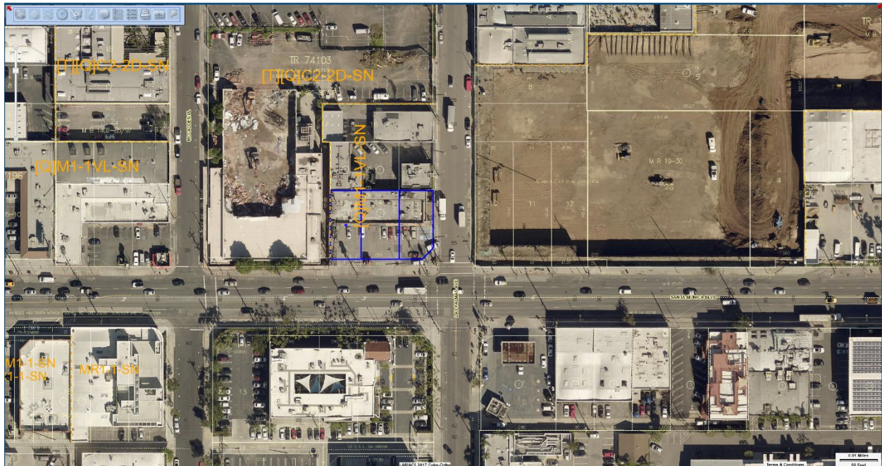
ZIMAS Aerial Map, 2017

The property is developed with a one-story, 5,040 square-foot commercial multi-tenant building. The building has three tenants containing the subject convenience store (“7-Eleven”), Magee’s Donuts, and Launderland Coin Laundry. According to the plot plan attachment that was submitted to City of Los Angeles Building and Safety dated May 14, 2012, there are twelve on-site parking spaces.