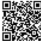
QR Code to Forms for In-Person Filing