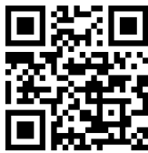
QR Code to Online Appeal Filing

An appeal application must be submitted and paid for before 4:30 PM (PST) on the final day to appeal the determination. Should the final day fall on a weekend or legal City holiday, the time for filing an appeal shall be extended to 4:30 PM (PST) on the next succeeding working day. Appeals should be filed early to ensure that DSC staff members have adequate time to review and accept the documents, and to allow appellants time to submit payment.